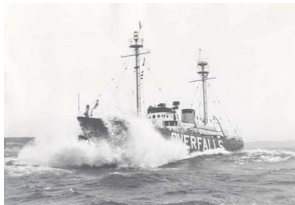
WLV-605 on the Overfalls station

It's a sad situation for a great ship. We wish the Society and WLV-605 well in this crisis.