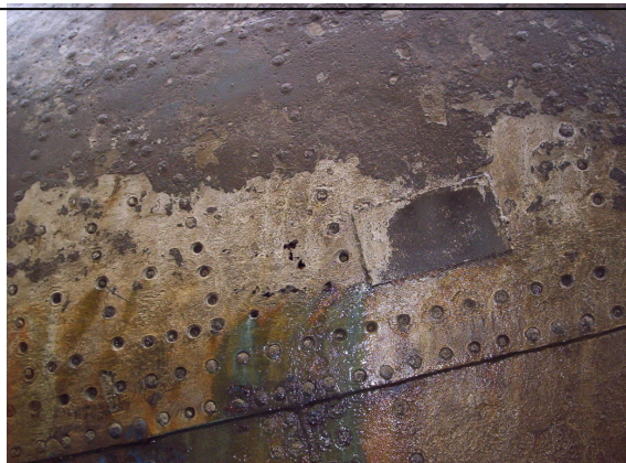
A small section of the hull after pressure wash. Note the Foundation installed patch and small holes revealed when the rust was removed. She got to the shipyard just in the nick of time!